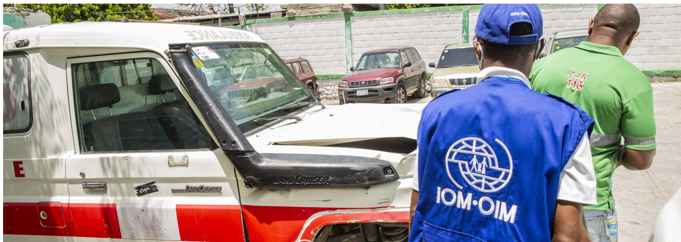
Repair works to the National Ambulance Center (CAN) during the COVID-19 response