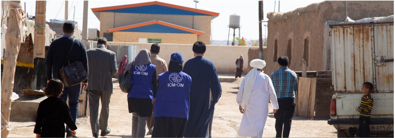
Assessment of needs carried out by IOM Iran in an Afghan settlement.