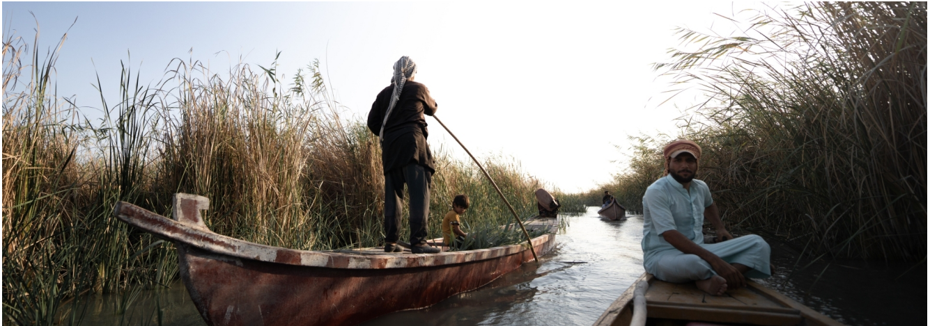
According to IOM's Climate Vulnerability Assessment, some 60,000 people were displaced due to climate change between January 2016 and October 2022