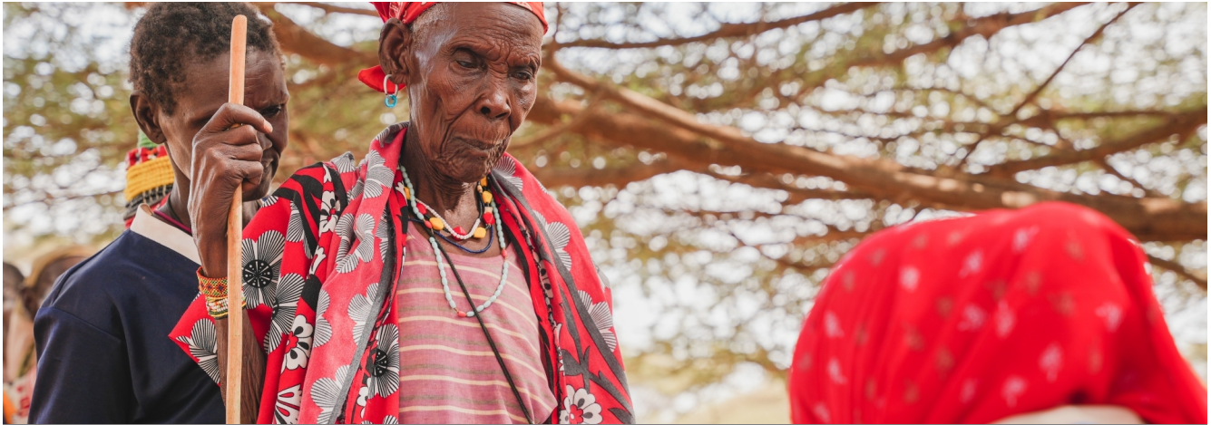
Climate-affected communities receiving non-food items and cash-based assistance