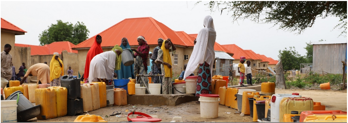
Women gather water in Gubio Camp, Borno State, Nigeria