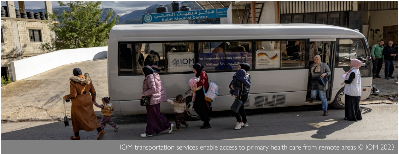
IOM transportation services enable access to primary health care from remote areas