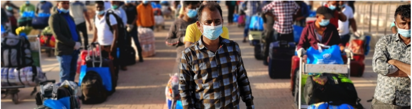
Bangladeshi migrants returned home through VHR charter flight from Benghazi Benina airport. @Moayad