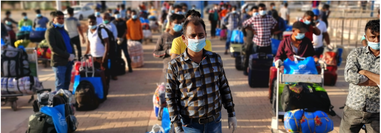
Bangladeshi migrants returned home through VHR charter flight from Benghazi Benina airport.