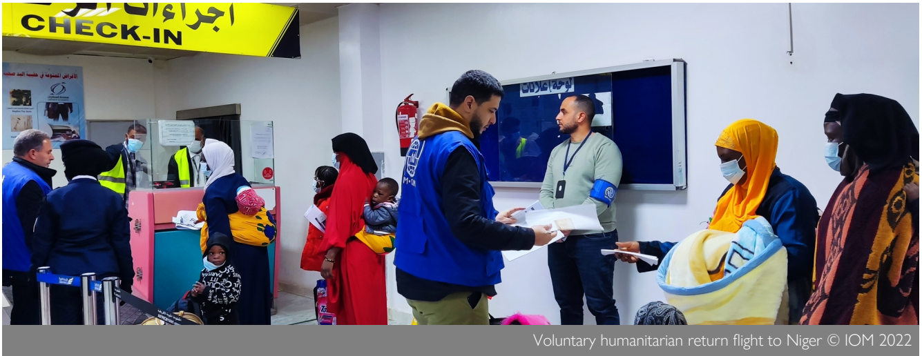
Voluntary humanitarian return flight to Niger