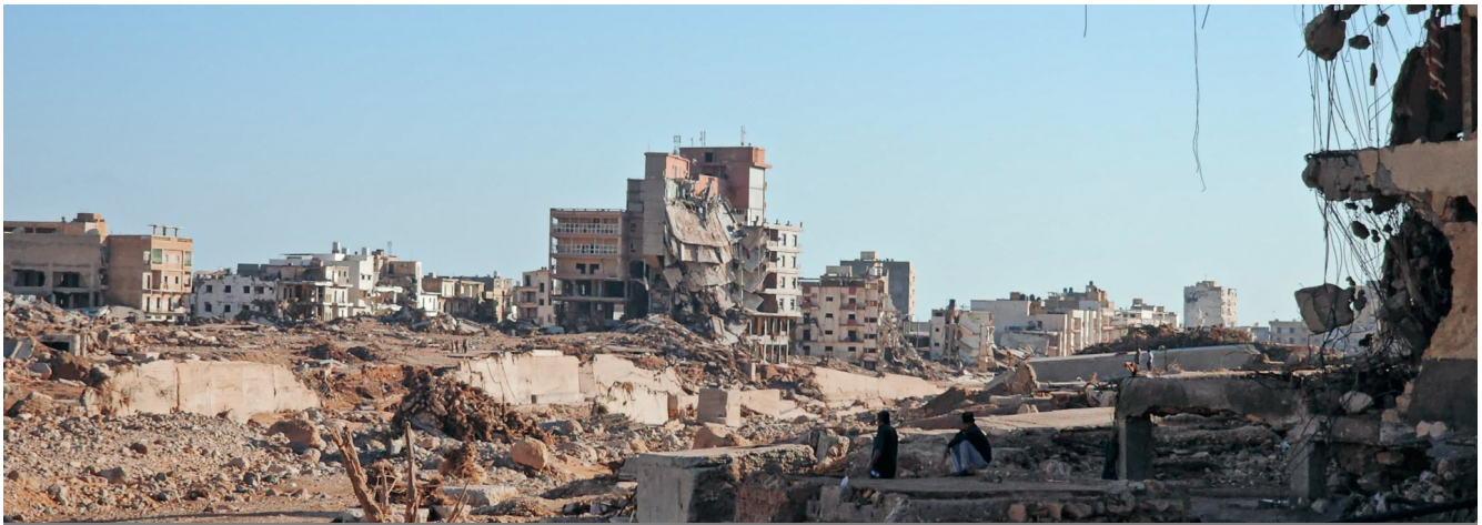
The situation in Derna after Storm Daniel