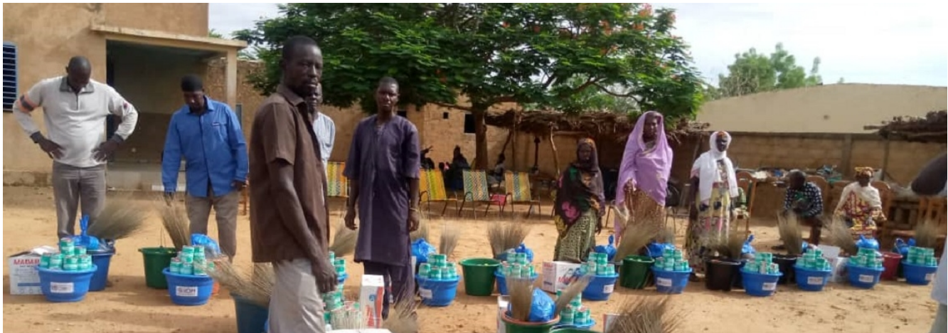
Protection kit distribution to IDPs in Mopti