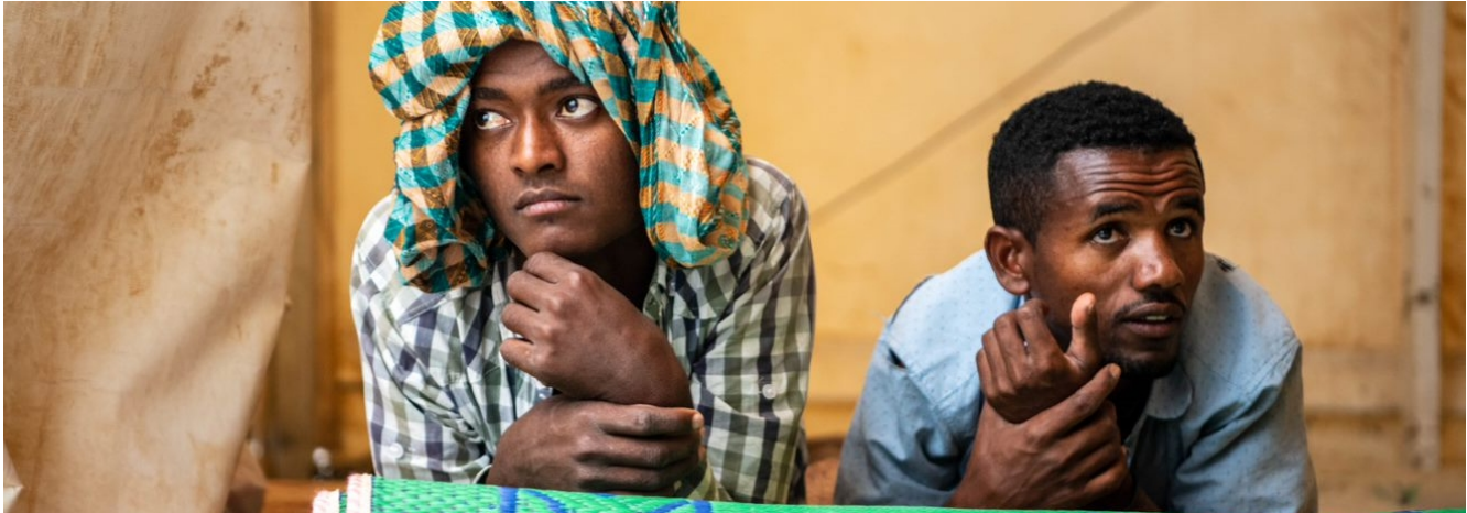
Migrants receiving NFIs in Yemen