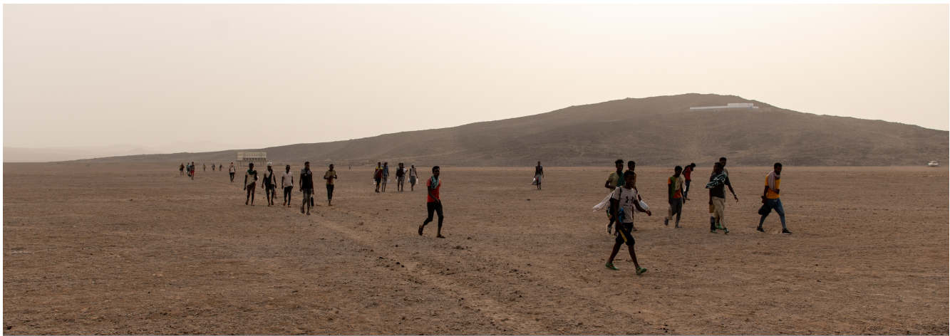
Migrants transiting in Djibouti, 2022.