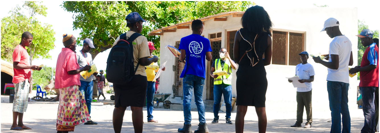
IOM teams conduct COVID prevention training for a site leadership committee at the Mandruzi resettlement site, Sofala province.