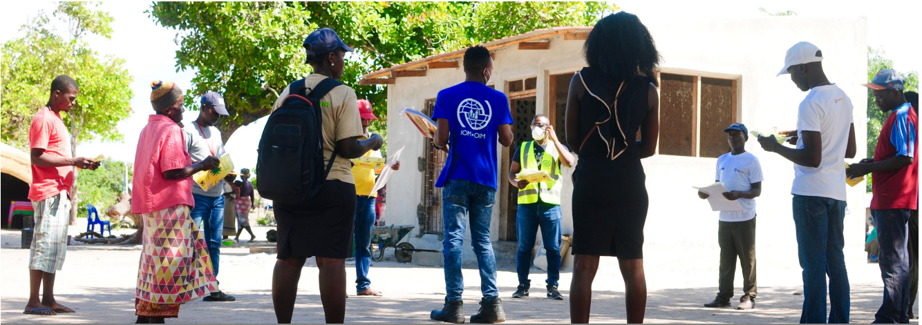
IOM teams conduct COVID prevention training for a site leadership committee at the Mandruzi resettlement site, Sofala province.