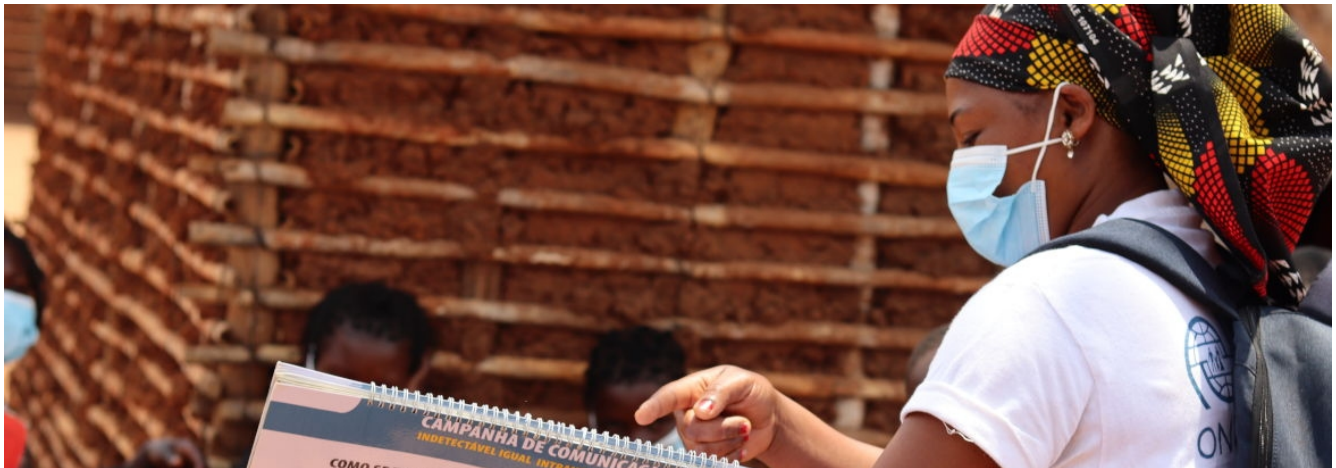
IOM Community Health Activist conducting health promotion on HIV/STI prevention in Manengane Resettlement Centre, Chiure, © IOM 2021 / A. Sina-Odunsi