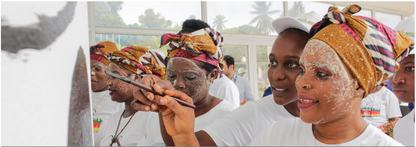
Dance and painting sessions for women convey messages of peace and social harmony.