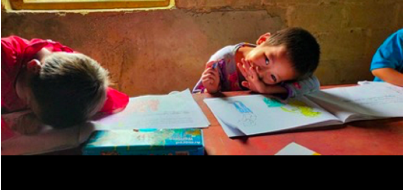
Children of returned migrants learning about COVID-19 prevention through colouring books, near Banmaw, Kachin State