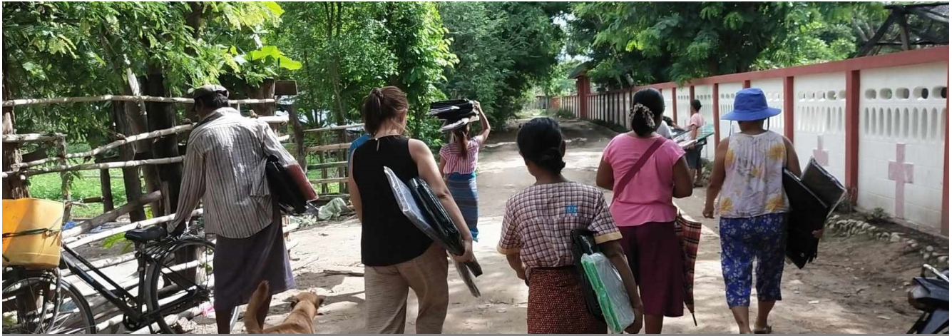
IDPs taking NFIs back to their home, Myanmar 2023.