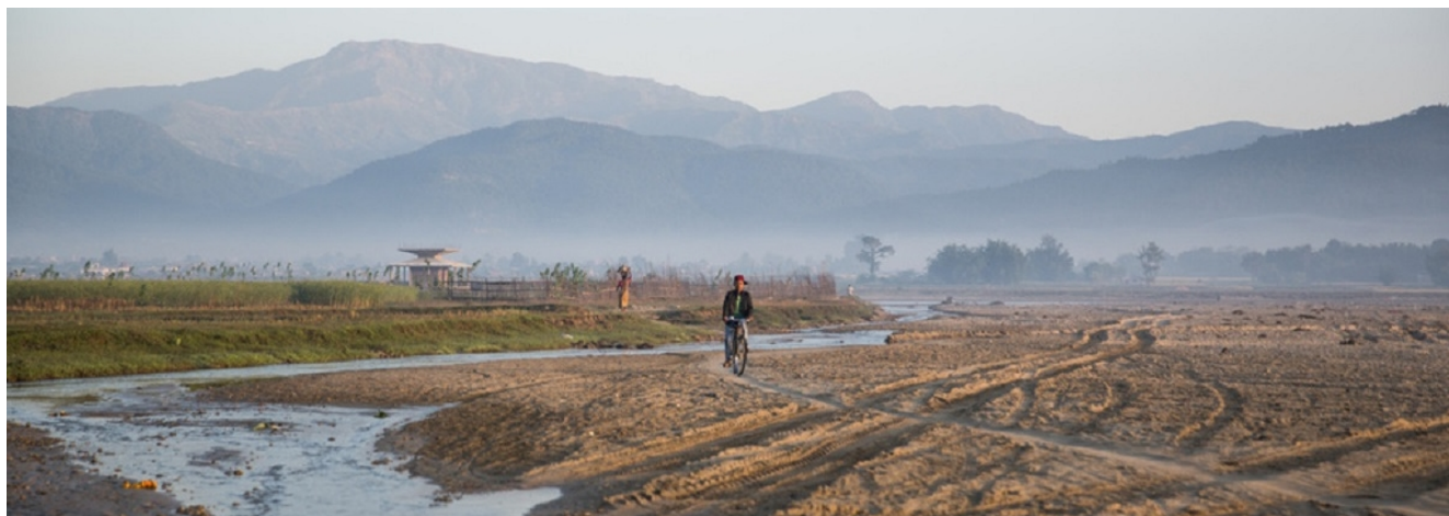
River in Udaipur region during the dry season