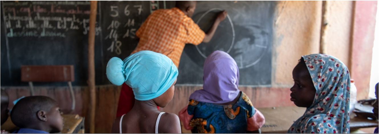
Children receive protection and sustainable reintegration assistance, including to ensure their return to school