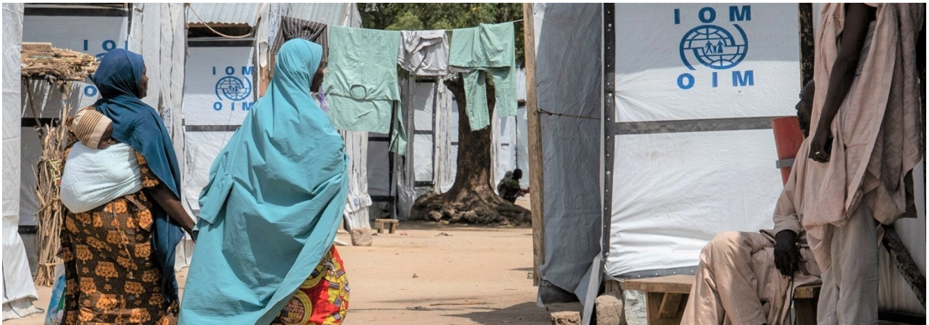
Gubio camp hosts more than 30,000 internally displaced persons in north-east Nigeria, where humanitarian needs have grown significantly in 2020.