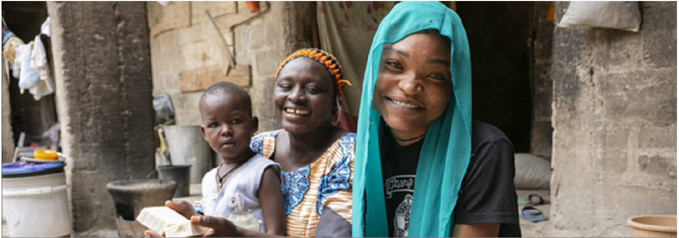
Beneficiaries supported with livelihood training start-up grants for Soap Production in Borno State