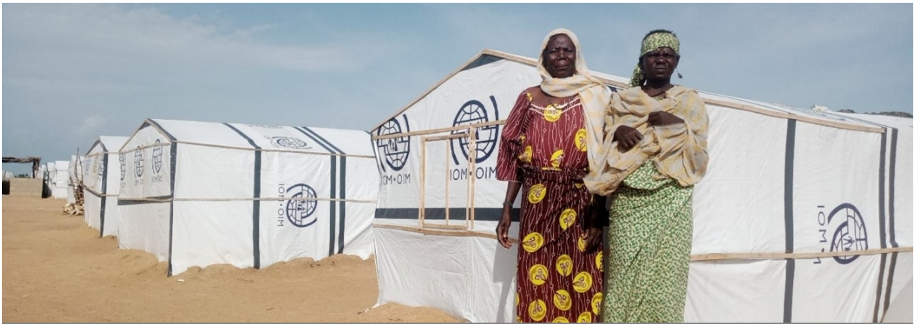
IDPs in front of their emergency shelter constructed by IOM in Borno State.