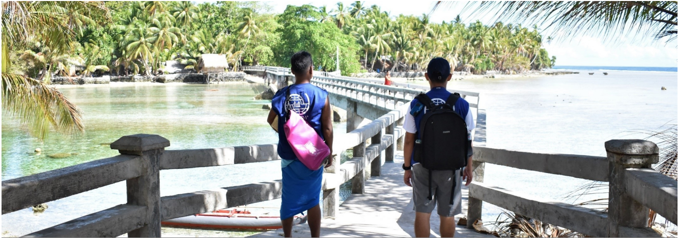
IOM Micronesia in Kapingamarangi Atoll, Pohnpei, FSM. Photo Credit: Lee Perez, IOM 2020.