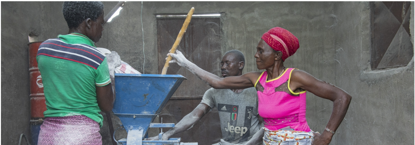
Women and youth work together to develop income-generating activities, thereby strengthening bonds and fostering community development in Leomidouo.