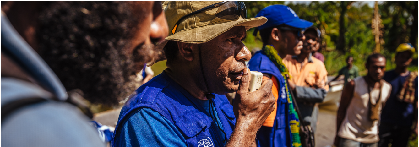
IOM coordinating flood response