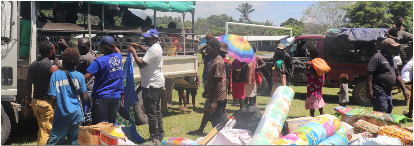
IOM responding to the volcano eruption of Mt Bagana.