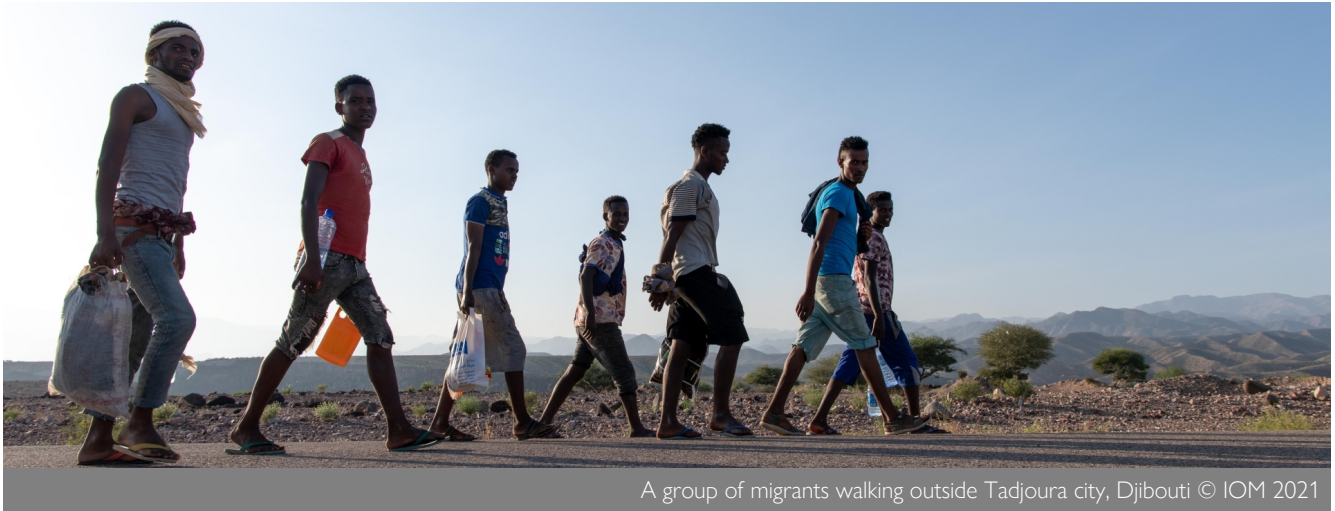
A group of migrants walking outside Tadjoura city, Djibouti