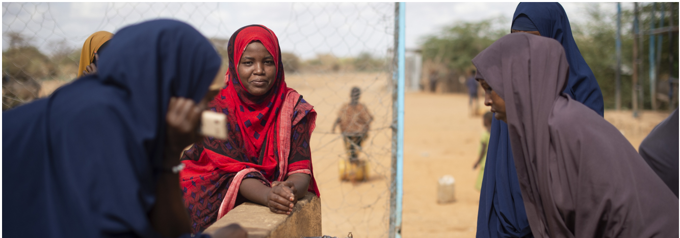
Water supply improvements, Doolow, Gedo Region.