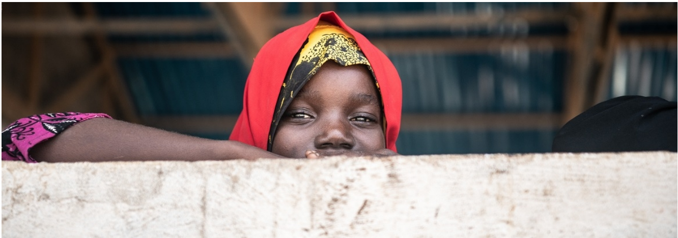
A girl in Marka, Lower Shabelle, a town liberated from a violent extremist group a few years ago.