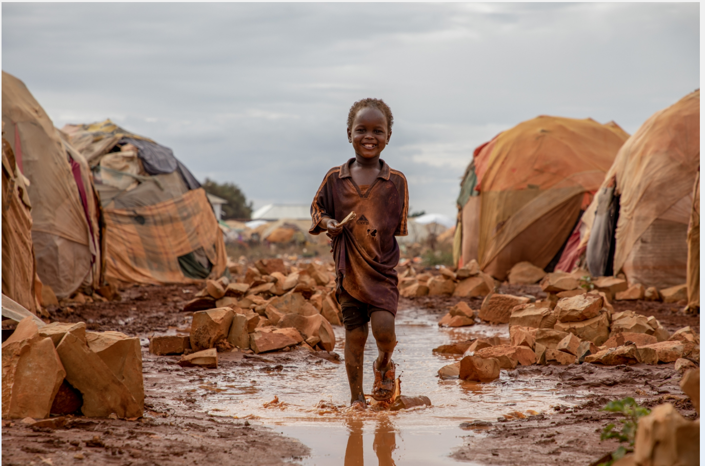
A boy plays in muddy water after a heavy downpour in Nasteexo, Baidoa

Priority Country – SG Action Agenda on Internal Displacement | Cohort Country - Early Warnings for All