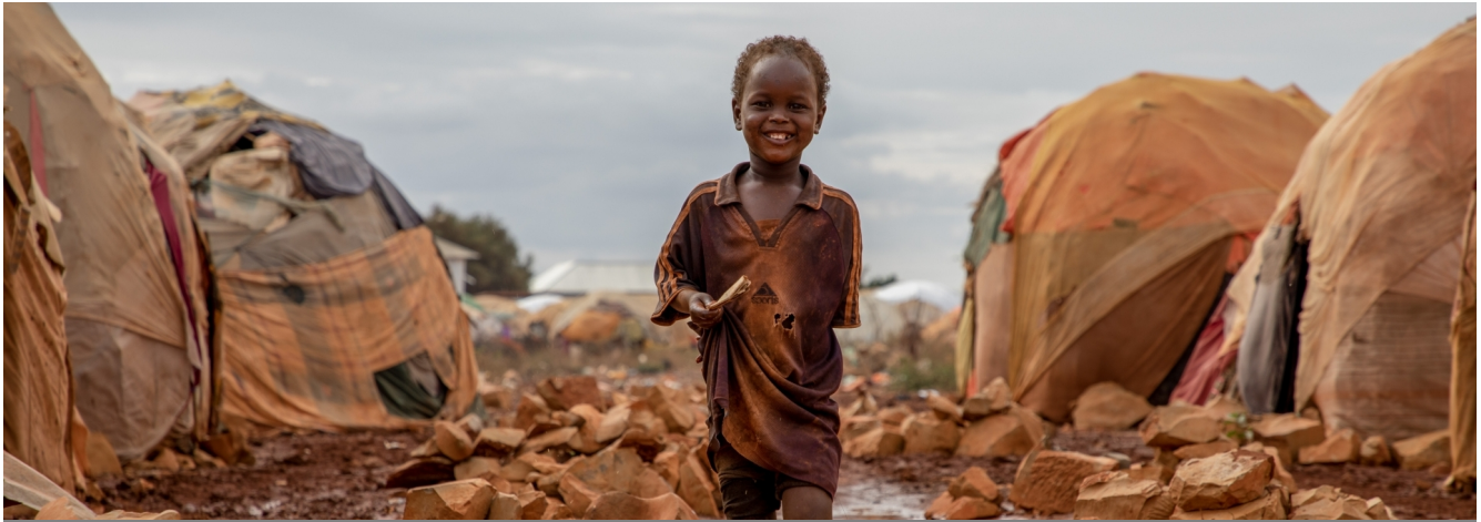
A boy plays in muddy water after a heavy downpour in Nasteexo, Baidoa