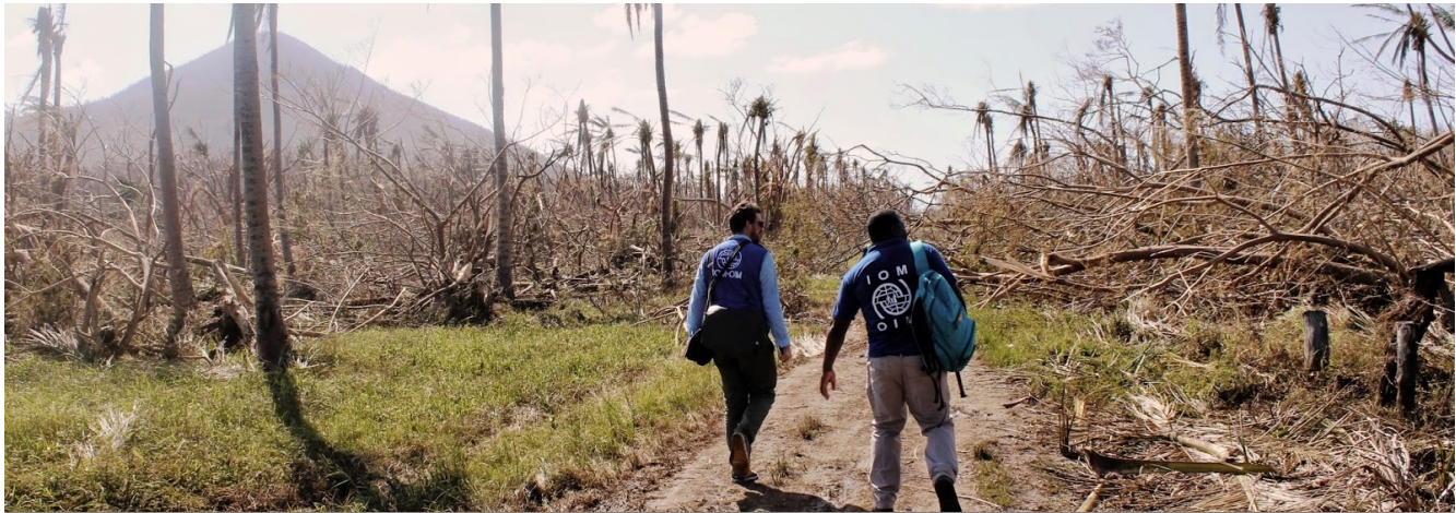
IOM staff surveying damage following Cyclone Pam making landfall in 2015