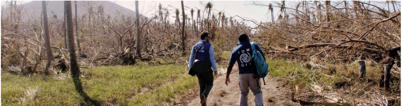
IOM staff surveying damage following Cyclone Pam making landfall in 2015