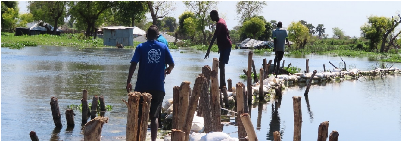
Local youth in Bor participate in building broken dikes to prevent their villages from flooding, with support from IOM.