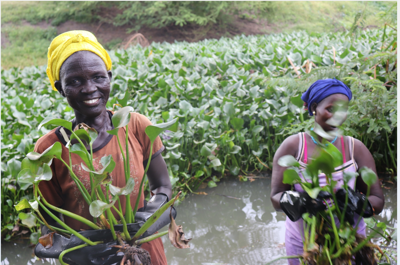
Women in Bentiu collecting hyacinths for their floating gardens project.