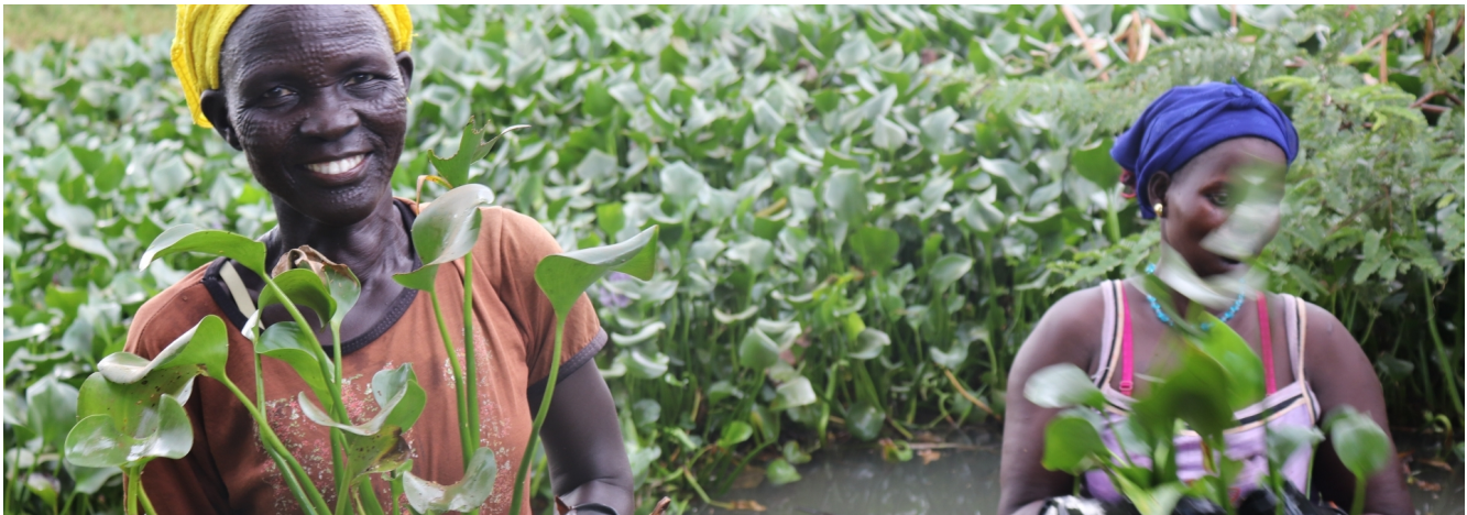
Women in Bentiu collecting hyacinths for their floating gardens project.