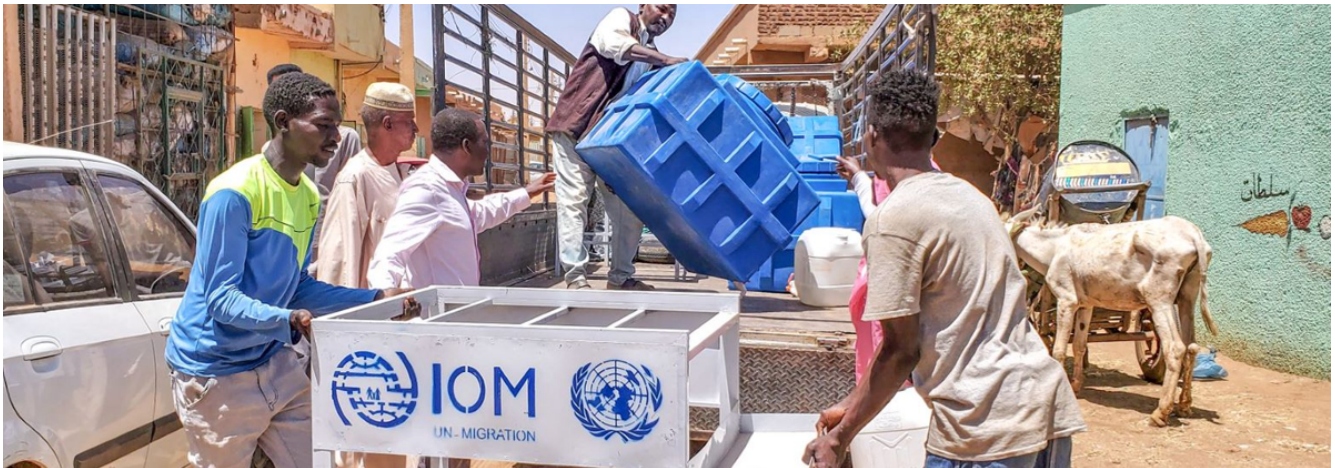
IOM Distributed Handwashing Stands for the Ombada Community to promote better hygiene practices and mitigate the spread of COVID-19. 31 March 2020.