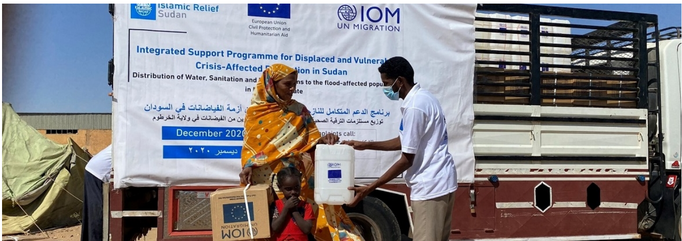
Beneficiaries receiving hygiene kits and jerrycans during distribution mission for flood response in Wad Ramli, Khartoum State.