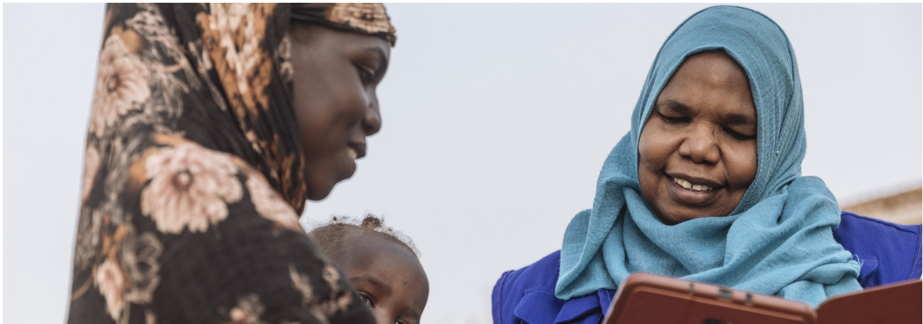
IOM staff conducting DTM activities in Al Fashir, Sudan.