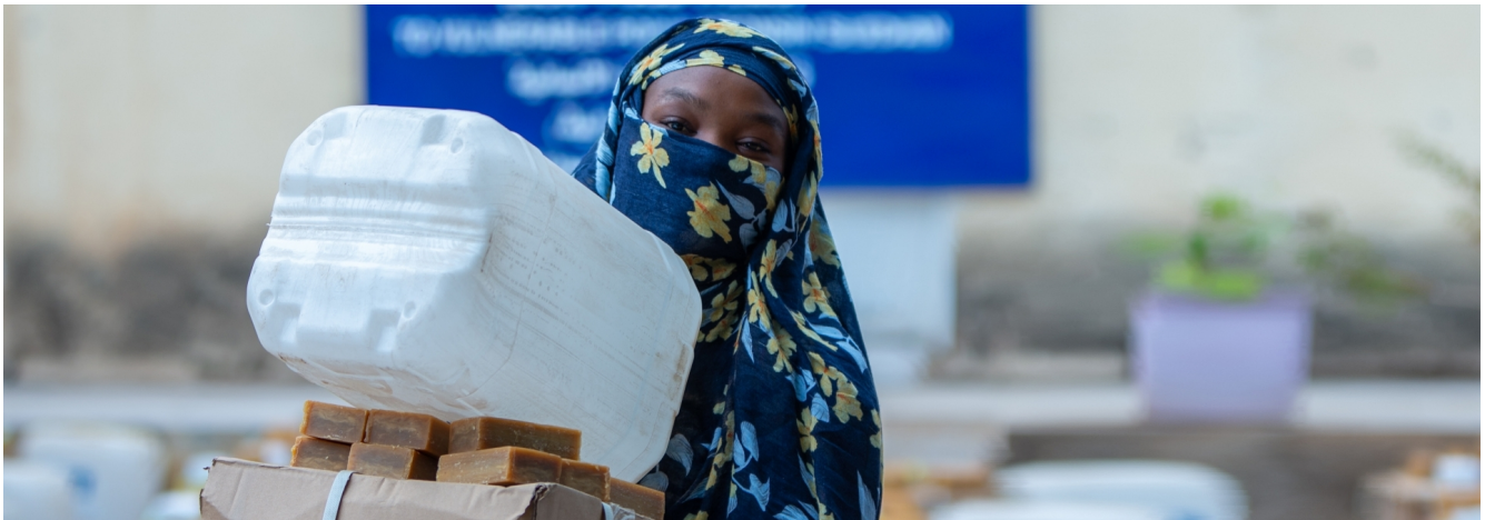
Distribution of NFI kits to displaced families in Port Sudan.