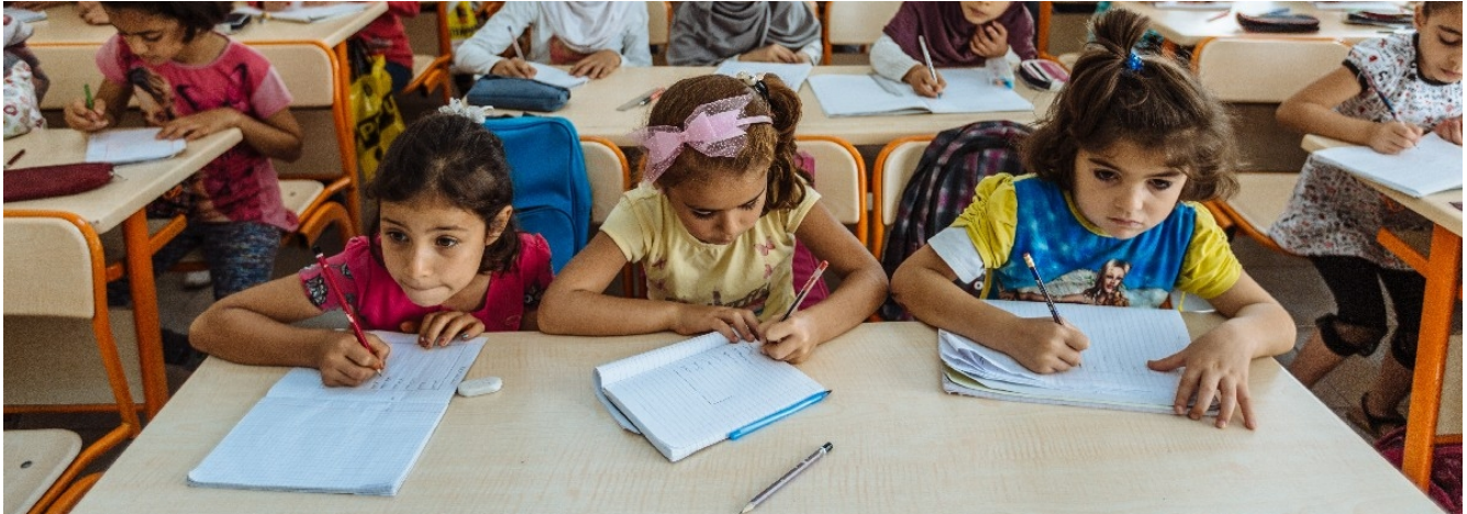
Syria Regional Refugee and Resilience Plan 2021