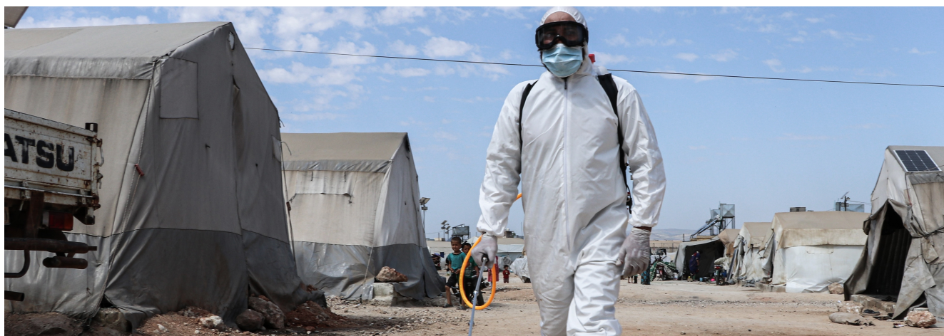
Sanitizing a displacement site in Syria