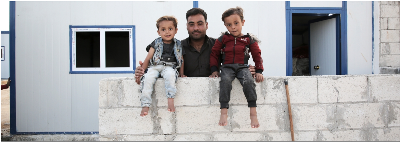
A father stands proudly with his children in front of their new home, a symbol of hope, in Al Hoda camp, Idleb.