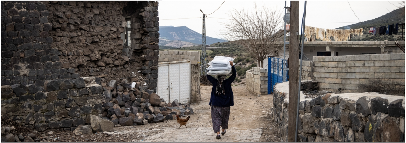
A village resident in Kahramanmaraş carries tarps she received from IOM