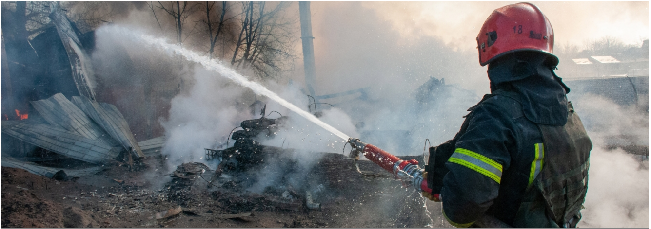
A firefighter extinguishes fire caused by shelling in Kharkiv, Ukraine. Winter 2022.