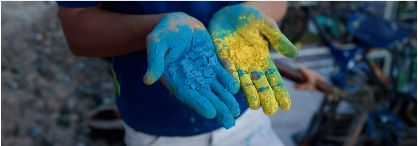
On Children's Day during the summer of 2023, over 10,000 people came together in Rzeszów, Poland, to enjoy a festival of colours, fairground rides, hair braiding and art workshops.