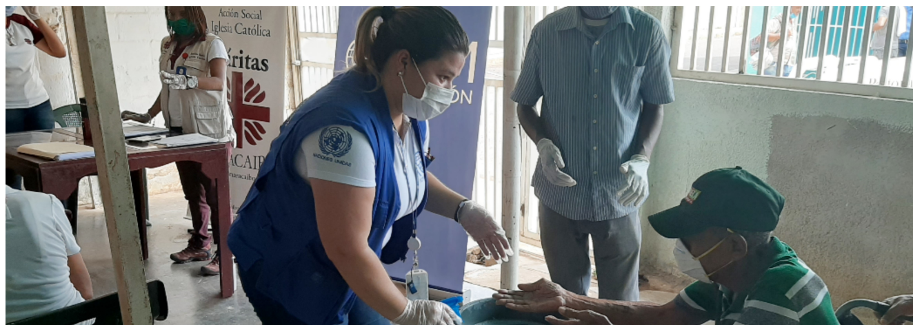
Informative session on the hygiene kits delivered in the La Trinitarias community, Maracaibo municipality, Zulia state, Venezuela.