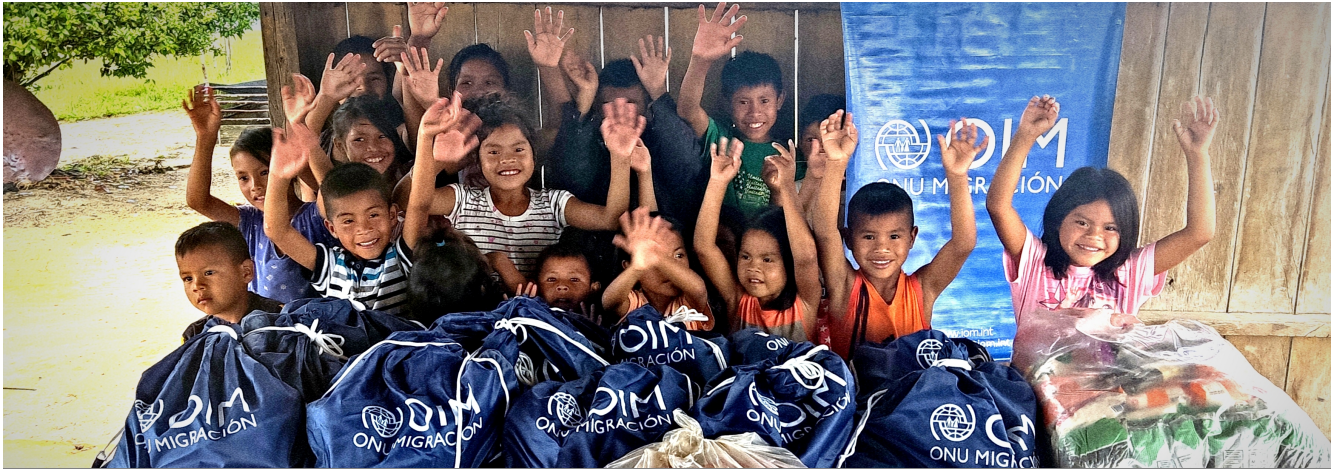
Group of children waving behind food items that IOM and its local implementing partner distributed in the indigenous community of Gran Sabana municipality, Bolivar State.