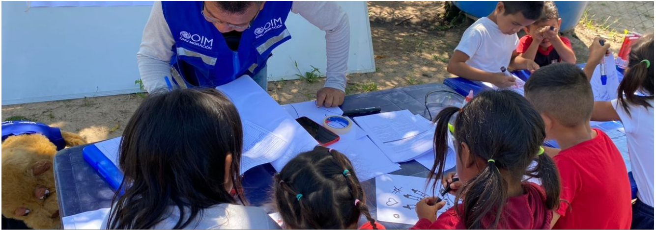
A children's group working on self-esteem in Atures municipality, Amazonas