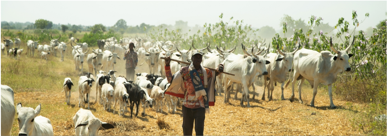
Transhumance flow monitoring at Mayo-Belwa Local Government Area, Adamawa state, Nigeria