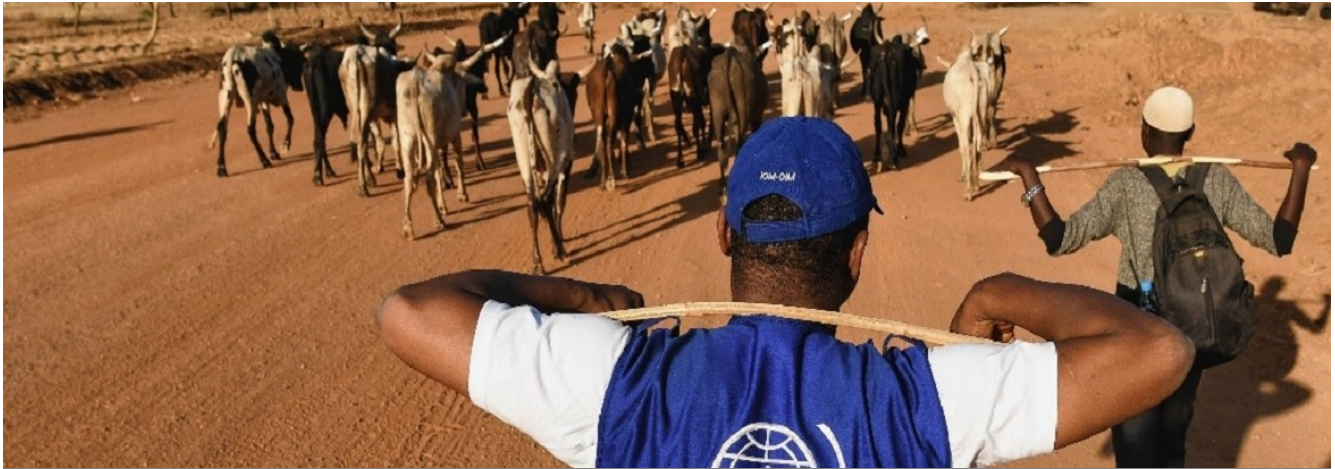
IOM Transhumance Tracking Tool enumerator monitoring transhumance flows in Burkina Faso.