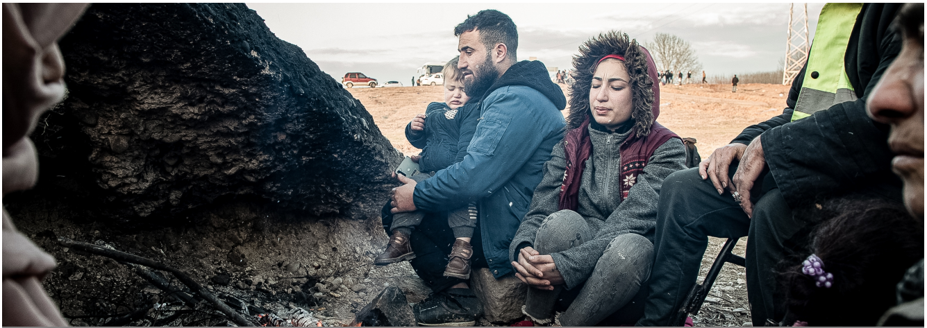
A Syrian family huddles by a fire at the Edirne border