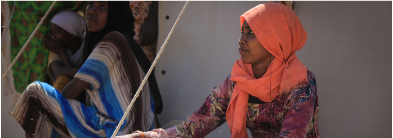
Migrant women sit together outside tents in an informal settlement, outside of which stranded migrants are sheltering in Marib governorate